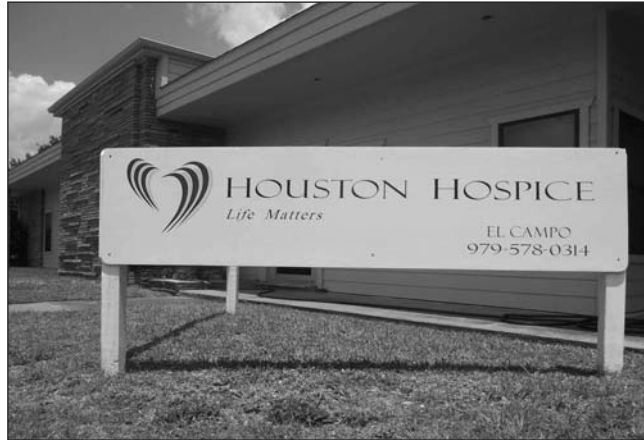
El Campo Campus

The El Campo branch has 21 staff members including a volunteer coordinator, an on call registered nurse, a marketer and the PRN staff. The staff makes a positive impact on the rural community by providing compassionate end-of-life care to their patients and families no matter how far the distance. In addition, the staff offers community bereavement in the counties they serve.